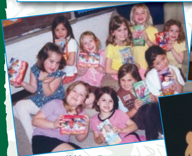
Girl Scout Troop 41273, cookies for teleconference