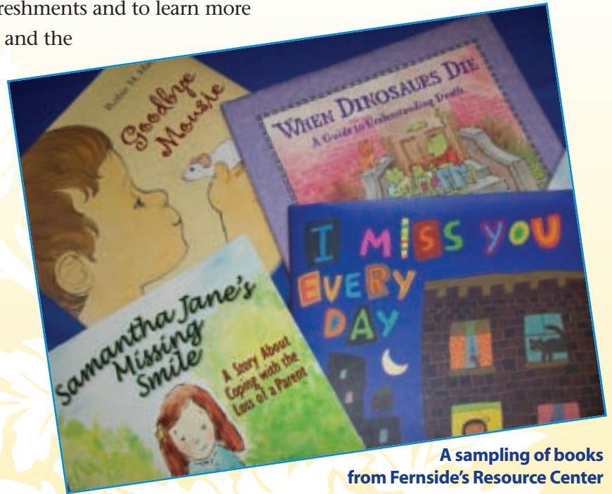
A sampling of books from Fernside's Resource Center

Stop in for refreshments and to learn more about our services and the many ways that you can support children and families who have experienced a death. We look forward to seeing you in August!