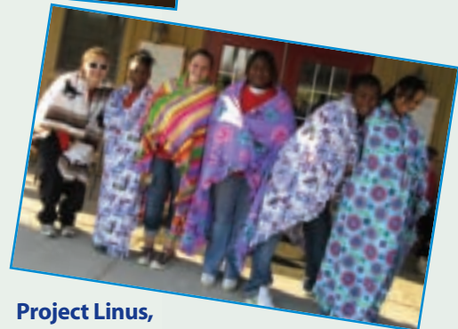
Project Linus, blankets for retreat