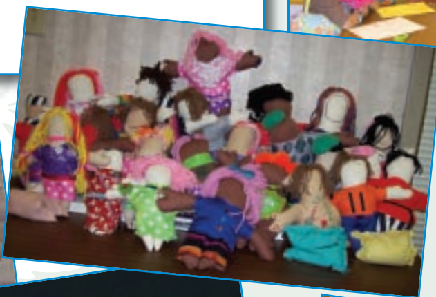
Isaac M. Wise Temple, "Create-A-Face" dolls for groups