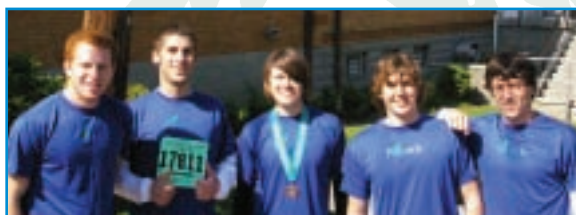
UC Sigma Phi Epsilon Fraternity, Flying Pig runners