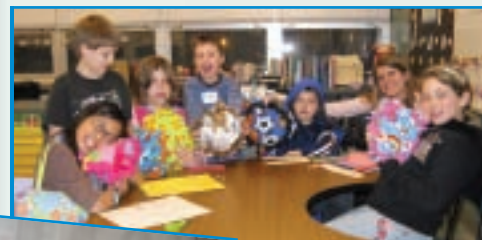
Cincinnati Woman's Club, pillows for groups