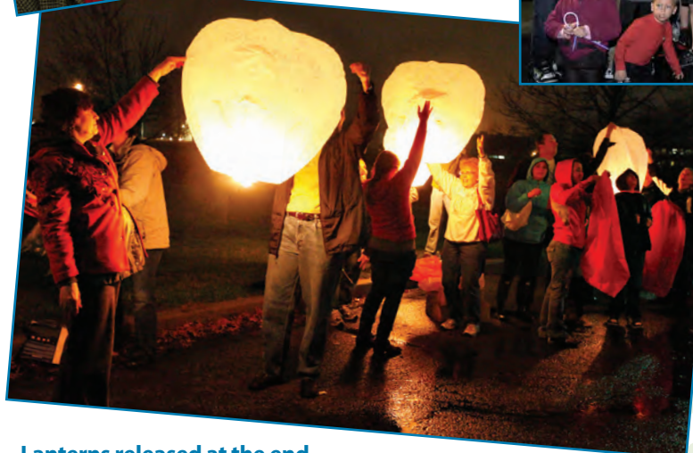
Lanterns released at the end of the night.

"Yes, it rained but the building, the people, the lanterns, all of it was beautiful.