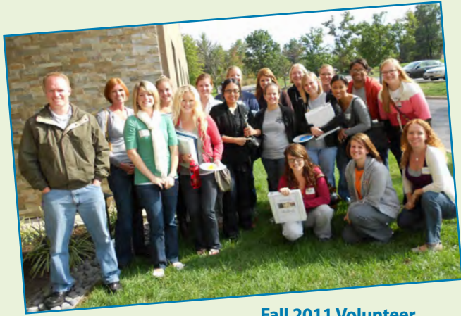
Fall 2011 Volunteer Facilitator Training Class